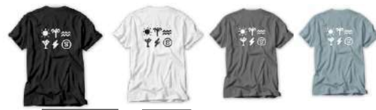
ICON TEE Black S M L White M L Charcoal S M L P. Blue S M L ¥5,400 + tax