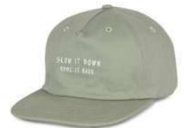
SOLD OUT N°3 Cotton Slate ORDER ¥4,900 + tax