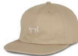
Sand ORDER ¥4,900 + tax