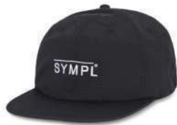
Black ORDER ¥4,900 + tax