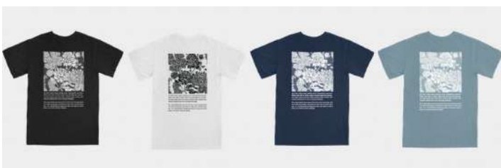
FLORAL TEE Black M L SOLD OUT White M L SOLD OUT NAVY M L P. Blue M L SOLD OUT ¥5,400 + tax