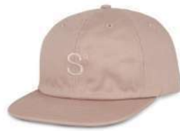
Salmon ORDER ¥4,900 + tax