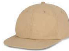
Sand ORDER ¥4,900 + tax