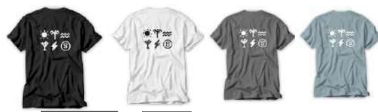
ICON TEE Black S M L White M L Charcoal S M L P. Blue S M L ¥5,400 + tax