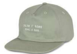
N o 3 Cotton Slate ORDER ¥4,900 + tax