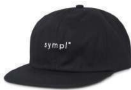
N o 2 Cotton Black ORDER ¥4,900 + tax