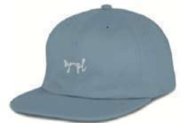
Powder Blue ORDER N o 2 Cotton ¥4,900 + tax