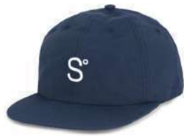
N o 1 NYLON Navy SOLD OUT ORDER ¥4,900 + tax