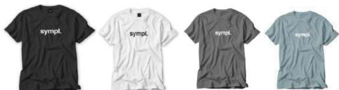
FONT TEE Black S M L SOLD OUT White M L Charcoal M L SOLD OUT P. Blue M L SOLD OUT ¥5,400 + tax