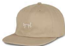
Sand SOLD OUT ORDER ¥4,900 + tax