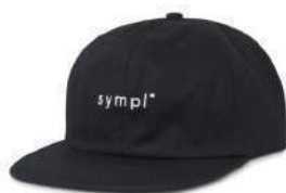
N°2 Cotton Black ORDER ¥4,900 + tax