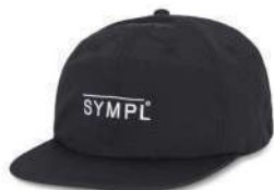
Black ORDER ¥4,900 + tax