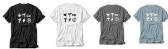
ICON TEE Black S M L White M L Charcoal S M L P. Blue S M L ¥5,400 + tax