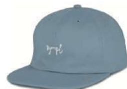
Powder Blue ORDER N°2 Cotton ¥4,900 + tax