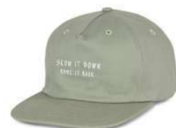
N°3 Cotton Slate ORDER ¥4,900 + tax