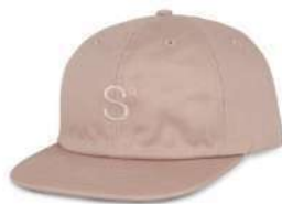
Salmon ORDER ¥4,900 + tax